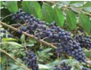
Chinese privet Ligustrum sinense