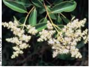
glossy privet Ligustrum lucidum