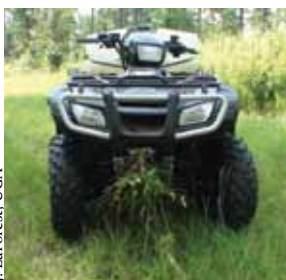
J. LaForest, UGA

Clean equipment carefully to prevent spreading invasive seed or plant pieces into another area.