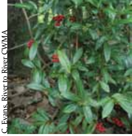
coral ardisia Ardisia crenata