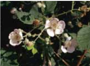
Himalaya blackberry Rubus armeniacus