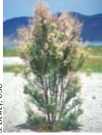
salt cedars Tamarix spp.