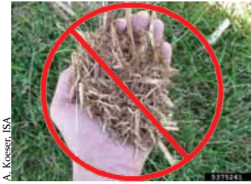
A. Koester, ISA

When disposing of invasive plant material, check for any seeds, fruit or cuttings that could re-sprout. At a minimum, bag these materials to help stop their spread. If it is permitted in your area and can be safely done, consider burning the material. If you use chemical treatment to eradicate invasive plants be sure to follow all label directions.