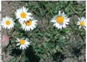
oxeye daisy Leucanthemum vulgare