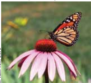
Monarch butterfly & Purple coneflower