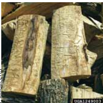
T. Kimoto, CFIA

America's forests are some of the most beautiful in the world. It is up to us to protect them. Pests such as the emerald ash borer which was found in the firewood below are quickly spread when people carry firewood or untreated wood products to new locations.