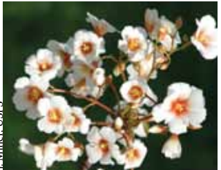
tungoil tree Vernicia fordii