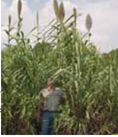
giant reed Arundo donax