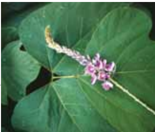
kudzu Pueraria montana var. lobata