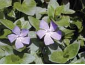
periwinkle Vinca spp.