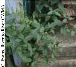
Japanese chaff flower Achyranthes japonica