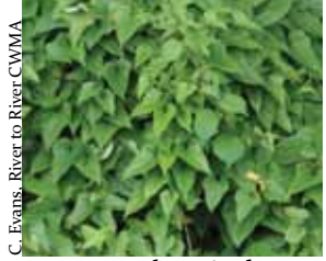
Chinese yam Dioscorea polystachya