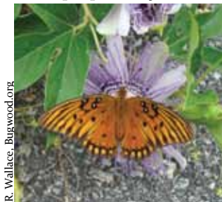
Gulf fritillary & Purple passionflower

Ask your nursery about non-invasive plant alternatives. Native plants often have similar landscaping characteristics as invasives, without the potential for ecosystem damage.