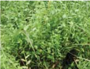
small carpgrass /hairy jointgrass Arthraxon hispidus