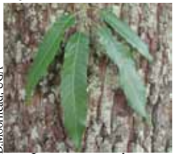
sawtooth oak Quercus acutissima