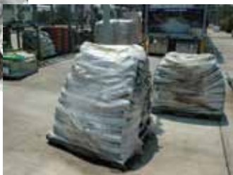
D. Moorhead, UGA