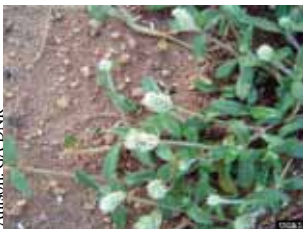
oriental bittersweet Celastrus orbiculatus