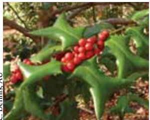
Chinese holly Ilex cornuta