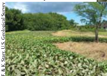
Common water hyacinth