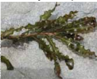
curlyleaf pondweed Potamogeton crispus