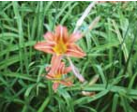
tawny daylily Hemerocallis fulva