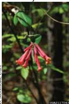
Native Coral Honeysuckle