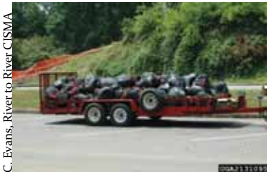
C. Evans, River to River CISM

Invasive plant material may resprout if left uncontained