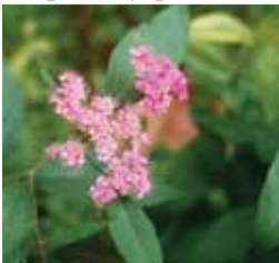
Japanese spiraea Spiraea japonica