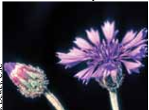
cornflower Centaurea cyanus