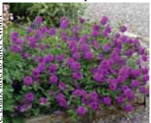
Moss vervain Glandularia pulchella