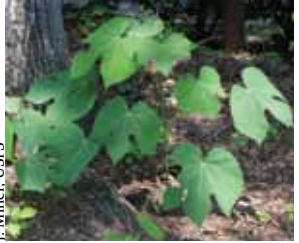
Chinese parasoltree Firmiana simplex