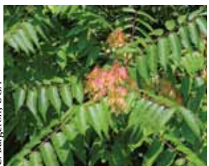
tree-of-heaven Ailanthus altissima