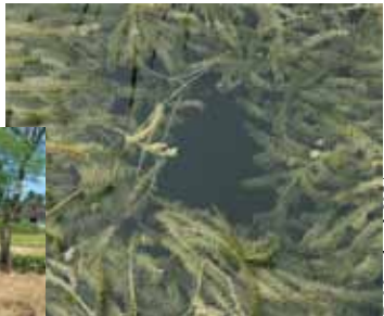
Hydrilla or waterhyme

Many continue to be sold through aquarium and pond supply dealers, both online and in retail garden centers. Infestations are often the result of the improper disposal of plants or water from ornamental ponds or the overflow of ponds into local waterways after heavy rains.