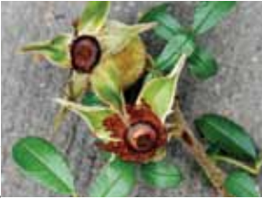
McCartney rose Rosa bracteata