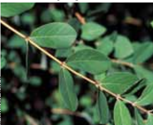
sweet breath of spring Lonicera fragrantissima