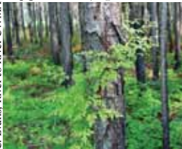
Japanese climbing fern Lygodium japonicum