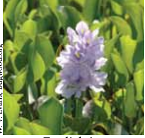
waterhyacinth Eichhornia crassipes