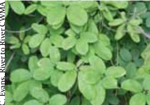
chocolate vine Akebia quinata