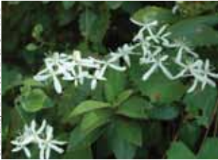
sweet autumn virginibower Clematis terniflora