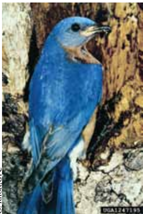
Eastern bluebird enjoying an insect snack

Using native plants in your landscaping promotes a healthier interactive local ecosystem and supports local food webs and habitats for wildlife.