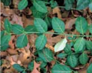
winter creeper Euonymus fortunei