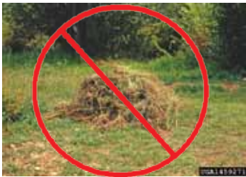
S. Dewey, USU

Invasive plant material may resprout if left uncontained