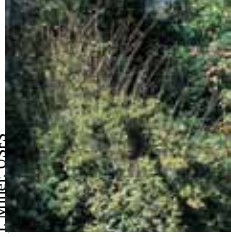
thorny olive Elaeagnus pungens