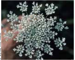
Queen Anne's lace Daucus carota