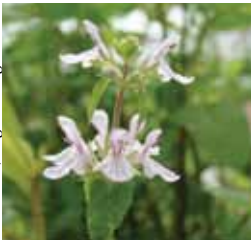
Florida betony Stachys floridana