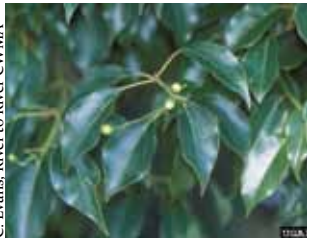
camphortree Cinnamomum camphora