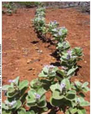
beach vitex Vitex rotundifolia