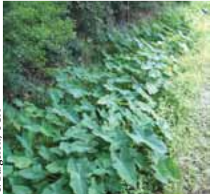
coco yam, wild taro Colocasia esculenta