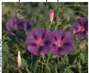
tall morningglory Ipomoea purpurea