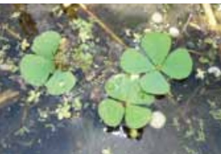
dwarf waterclover Marsilea minuta