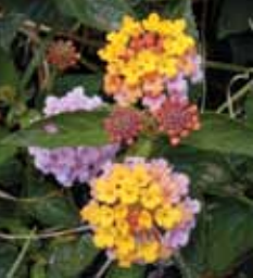
largeleaf lantana Lantana camara