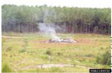
D. Moorhead, UGA

When possible safely burn invasive plant material