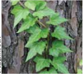
English ivy Hedera helix