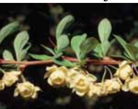
Japanese barberry Berberis thunbergii