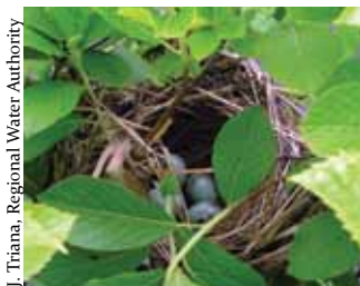
Red-winged blackbird nest