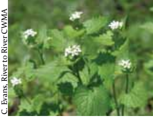
garlic mustard Alliaria petiolata