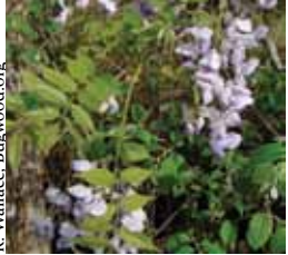
Non-native wisterias Wisteria spp.