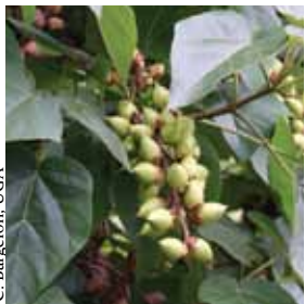
princesstree Paulownia tomentosa