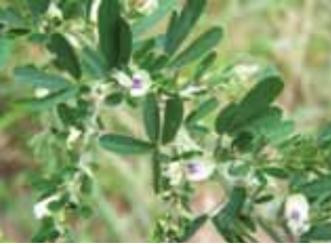
sericea lespedeza Lespedeza cuneata