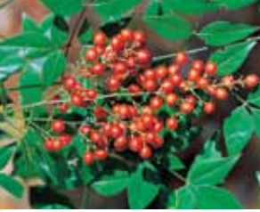
sacred bamboo Nandina domestica