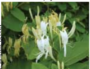
Japanese honeysuckle Lonicera japonica