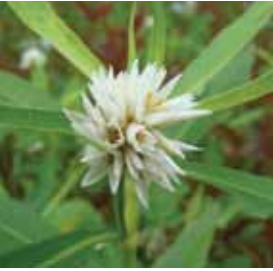
alligatorweed Alternanthera philoxeroides