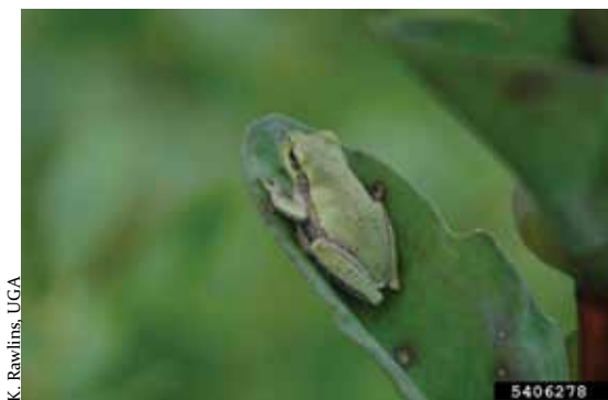
Native plants help to sustain wildlife