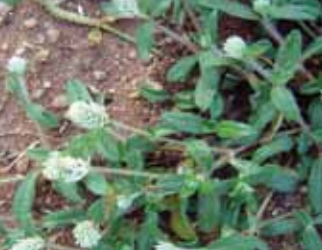
Arrasa con todo Gomphrena serrata