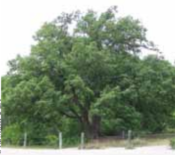
K. Rawlins, UGA

Native Tree Chinkapin Oak, grows to 60 ft. tall with a spread of 40-50 ft.