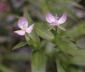
marsh dayflower Murdannia keisak