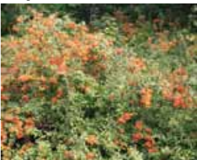
scarlet firethorn Pyracantha coccinea