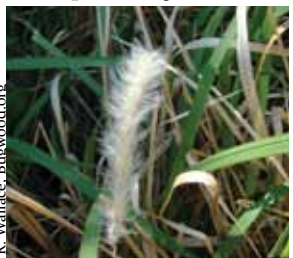
cogongrass Imperata cylindrica