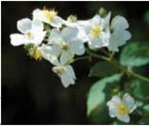
multiflora rose Rosa multiflora