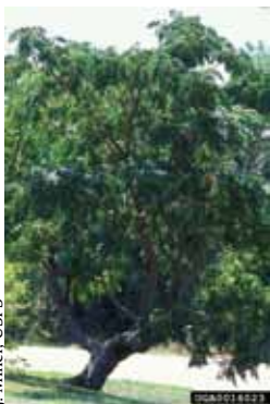
J. Miller, USFS

Native Tree Chinkapin Oak, grows to 60 ft. tall with a spread of 40-50 ft.