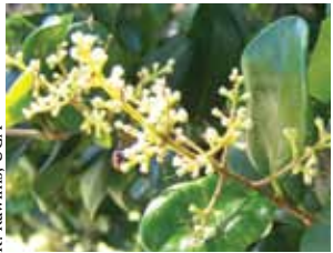
Japanese privet Ligustrum japonicum