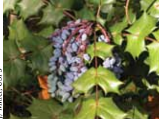
leatherleaf mahonia Mahonia bealei