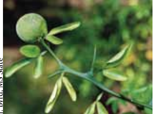
trifoliate orange Poncirus trifoliata