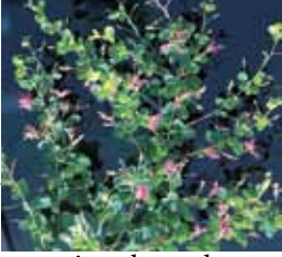
shrubby lespedeza Lespedeza bicolor