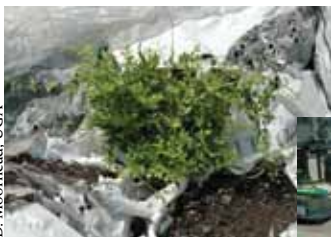
D. Moorhead, UGA