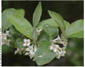
autumn-olive Elaeagnus umbellata