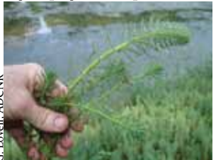
parrotfeather Myriophyllum aquaticum