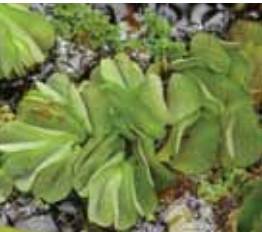
giant salvinia Salvinia molesta