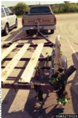
T. Pemas, NPS

Check clothes, belongings, pets and vehicles for seeds and pieces of invasive plants that may have attached themselves. These can drop off and begin growing to start an infestation in another location.