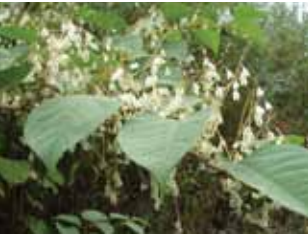
Sakhalin knotweed Reynoutria sachalinensis