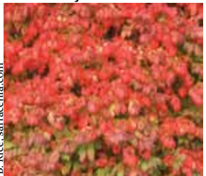
winged burning bush Euonymus alatus