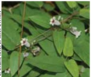
skunk-vine Paederia foetida