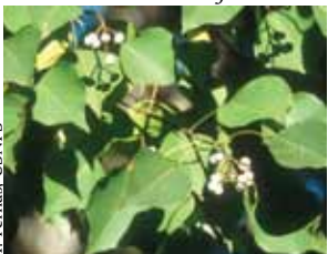
Chinese tallowtree Triadica sebifera