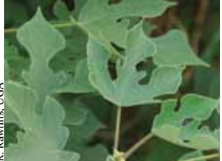
paper-mulberry Broussonetia papyrifera