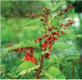
red sesbania Sesbania punicea