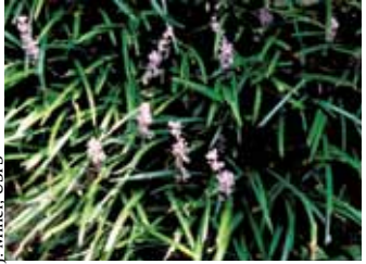
monkeygrass Liriope muscari